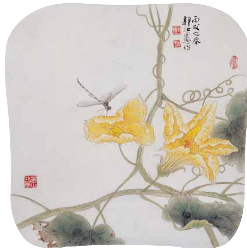
"Dragonfly Longing for Potpourri" 33 x 33cm 2006