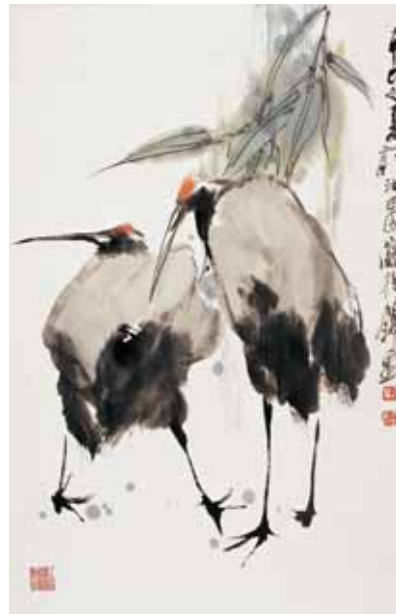
Two Cranes / Free Sketch

Another distinction between Chinese and Western painting can be observed in the