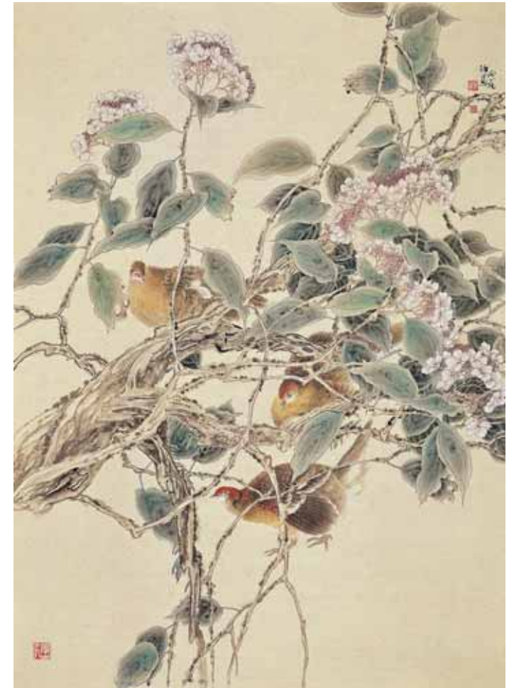
"Mountain Birds" 130 x 93cm 2006