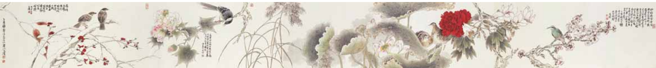
The Flowers and Birds in Four Seasons 392 x 40cm 2005

1973, participated in the National Arts and Crafts Exhibition. 1974, participated in the 4th National Fine Arts Exhibition. 1975, participated in the International Handicrafts Exposition in London, UK. 1978, participated in the Chinese Painting Tour Exhibition in Japan, North Korea, West Germany, Italy, Spain and etc., which was organised by the Chinese People's Association for Friendship with Foreign Countries. 1980, created the best-known work “ Hibiscus Carp ” for the Sichuan hall in the People's Congress Hall. 1982, won the “ Chinese Baihua Award ” for outstanding arts and crafts. 1984, participated in the International Exposition in Paris, France. 1986, held Individual Painting Exhibition in Chengdu. participated in the Chinese Modern Brushwork Painting Exhibition. participated in the Chinese Arts and Crafts Exhibition. participated in the International Exposition in Takenami, Japan. His works were collected by the Chinese Museum of Fine Arts and Crafts, and were collected by the Sino-American Culture Centre of San Francisco,