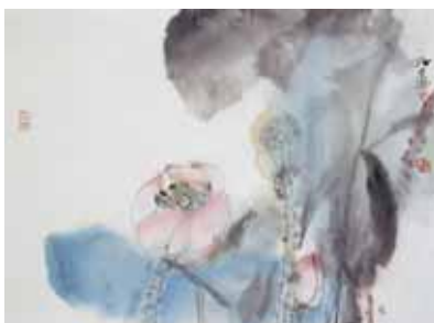
Water Lily / Free Sketch

combination of thick ink and thin ink. If a painting were full of thick or thin ink, it would lose the soul of the art. Thick and thin ink rely upon each other. Thick strokes should be brilliant but not stagnant, while thin strokes should be clear but not gloomy. The importance of ink is also related to use of color. Since ancient times, ink has not been employed simply as the color black. As ink is soluble in water, the water-ink ration blends color to different degrees, creating bright or faint colors such as gray or light gray. Painting is created with different shades of ink harmoniously. These all highlight the flexibility required in handling the brush in Chinese painting. As Chinese painting and calligraphy bear many similarities in terms of tools and the operations of strokes, people take it for granted that calligraphy and painting have the same origin. Yet they also have some differences. The operation of strokes in calligraphy is known for its diversification[SS9], especially in cursive style. The employment of ink in painting is more central in Chinese painting than in calligraphy. How to use stroke and ink involves the generalized Chinese painting techniques. It is not only a means of creating images, but also has an independent aesthetic value of its own.