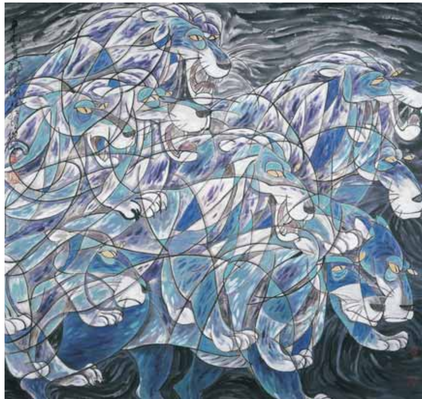
"Lions" 105 x 105cm 1994