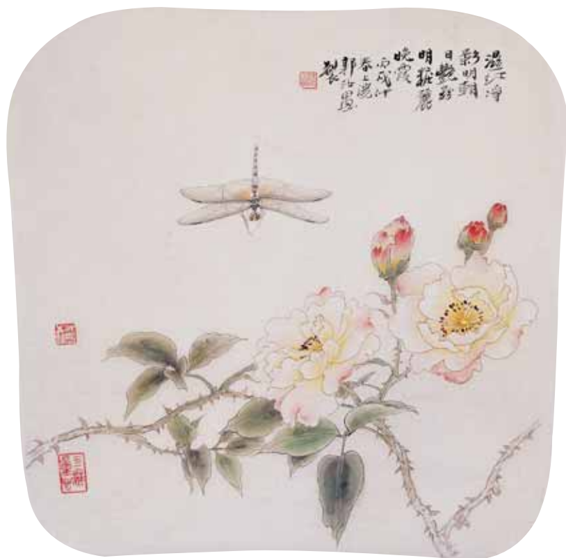
"Rose and Dragonfly" 33 x 33cm 2006