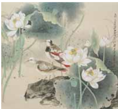
Water Lily / Fine Brushwork Painting