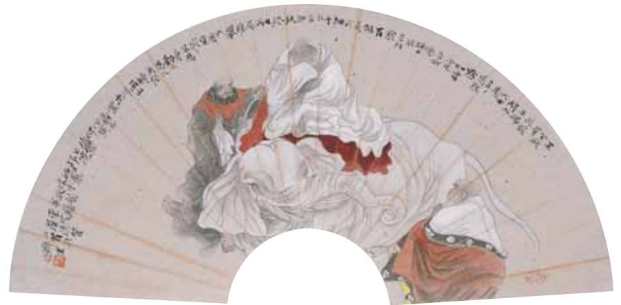
"Arhat" Fan Face 1998