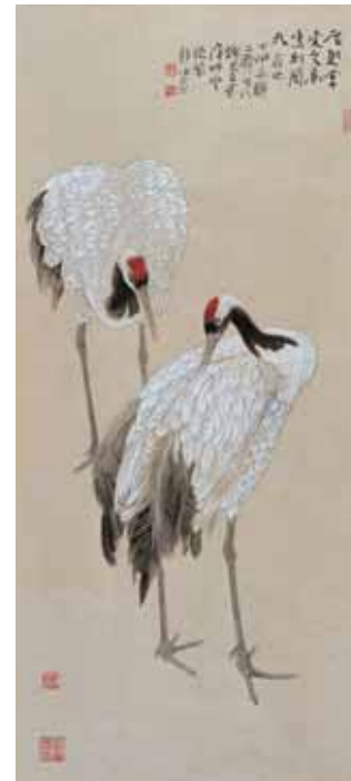
Two Cranes / Fine Brushwork Painting

use of perspective. "Perspective", a terminology in painting, is a technical method by which the objects can be displayed on a plane correctly, showing spatial or three-dimensional relationships. For instance, the nearer an object, the bigger its image is compared to objects behind it, and vice versa. Hence "perspective" is also called the "near-far principle". Western painting usually employs the focal point or perspective of an object, working like a camera with a fixed standing point. The picture is determined by space, and only contains those that can be photographed by lens. In contrast, Chinese painting does not necessarily have one fixed standing point, confined within a fixed visual scope. It can shift the standing point according to the painter's feeling and needs. This enables artists to draw all the visible and invisible objects into their pictures. This method is known as the "cavalier or multi-point perspective".