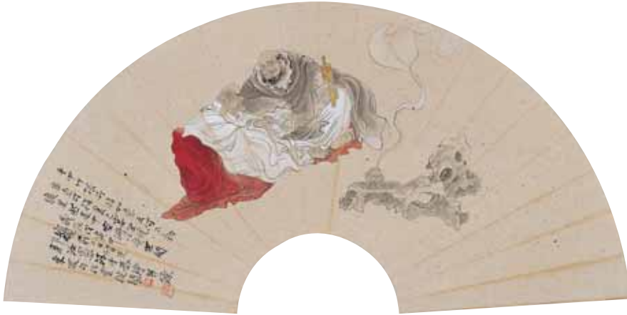
"Futucheng Discussing on Daoism" Fan Face 1998