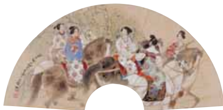
Eryou Shanfang (Eryou Mountain House)