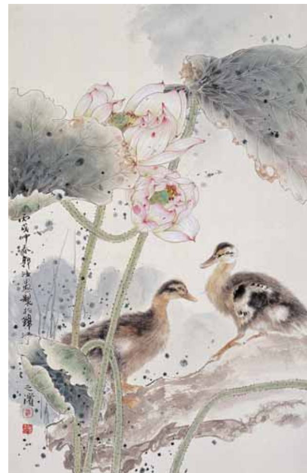
"Lotus Pond and Little Ducks" 68 x 45cm 2006