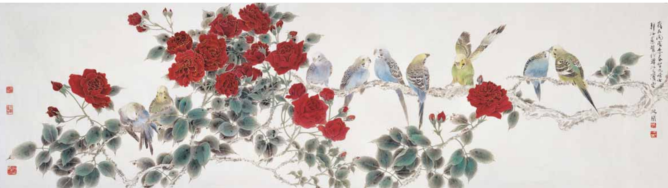
"Rose and parakeet" 50 x 180cm 2006