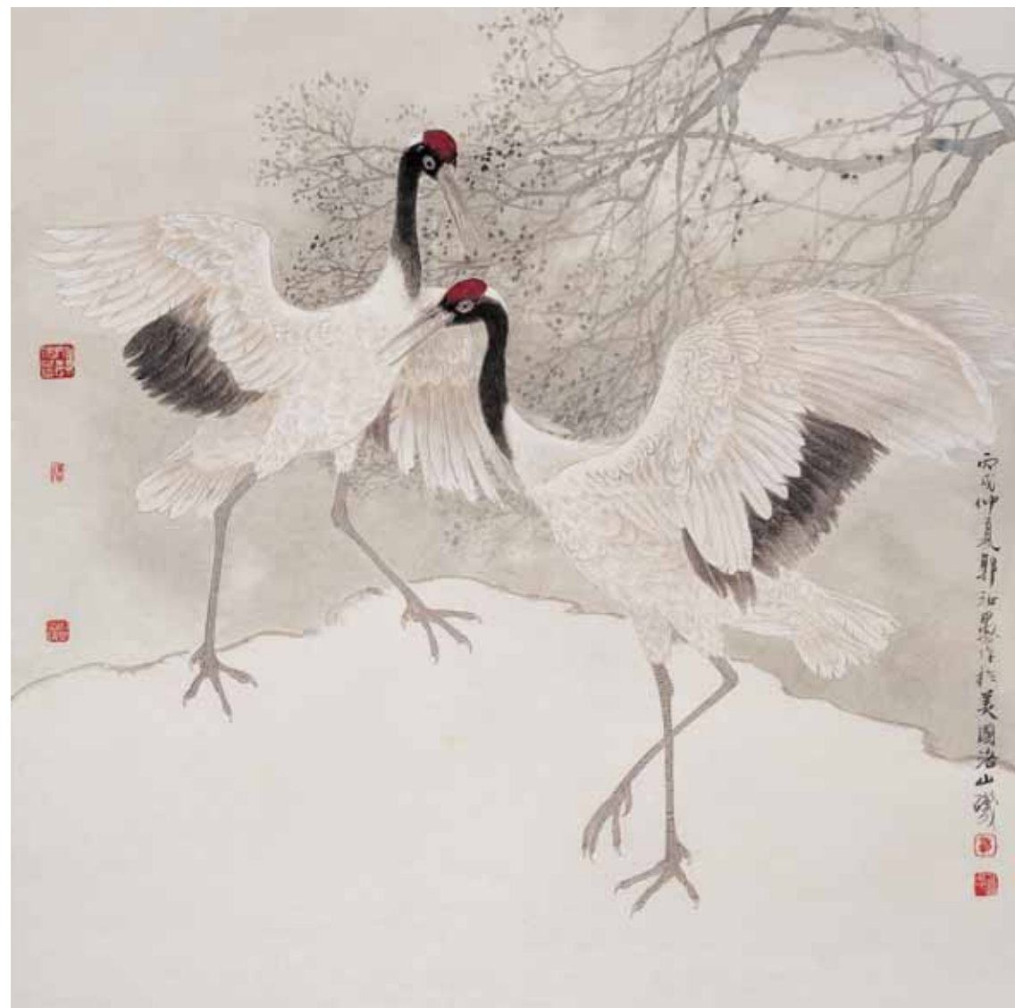
"Cranes" 66 x 66cm 2006